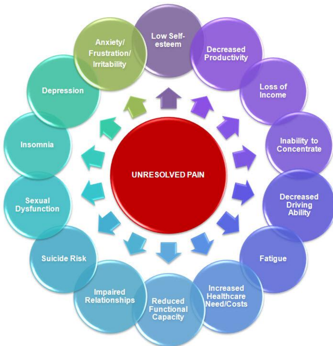
Figure 2. Consequences of Unresolved Pain.

The first portion of this article presents a very basic review of the pharmacology of the cannabinoids and endocannabinoid receptor system, drawing both from animal and human models. 6 Although cannabinoids have putative therapeutic